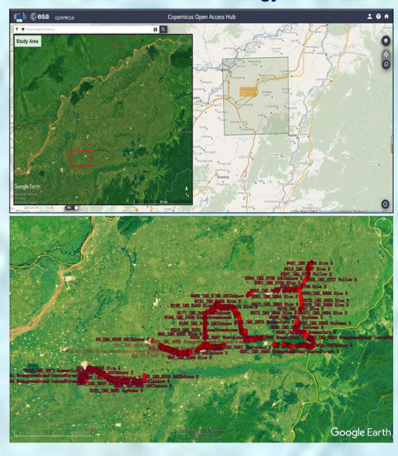
Fig.1 Study Area

The Chuangye Farm is located in Heilongjiang Province in Northeast China, within the range of 132-133 longitude and 47 latitude. It is an important single-season rice producing area in China. The small red rectangle on the left in Figure 1 represents the location of the chuangye farm.